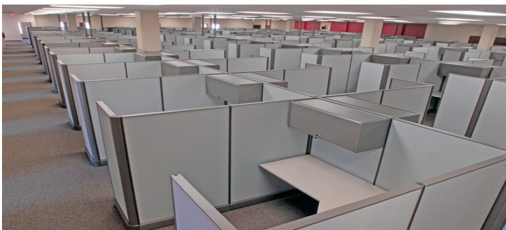
Figure 1: Typical office cubicle system

However, according even to its creator Propst, "The cubicizing of people in modern corporations is monolithic insanity" (Lohr, 1997). The cubicle provided workers with a walled-off personal space, attempting to replicate a cellular office but on a much smaller scale (Figure 1). Cubicle walls, usually at 5ft (150cm) high, were intended to provide both acoustic and visual privacy, but in practice many workers felt more self-conscious as they knew they were surrounded and could be overheard by others but couldn't actually see them. From an information/knowledge flow point of view, the cubicle did nothing to improve workplace communication, with workers now required to phone (or later email) colleagues who they had no visibility of but who may only be a couple of "cubes" or aisles away. According to Francis Duffy, founder of DEGW, an architectural practice specialising in workplace design, cubicles, often referred to as "pig-pens", were a poor compromise describing them as "a disease, a pathology of the office.... It doesn't give you privacy, it doesn't give you control over your environment" (Kremer, 2013).