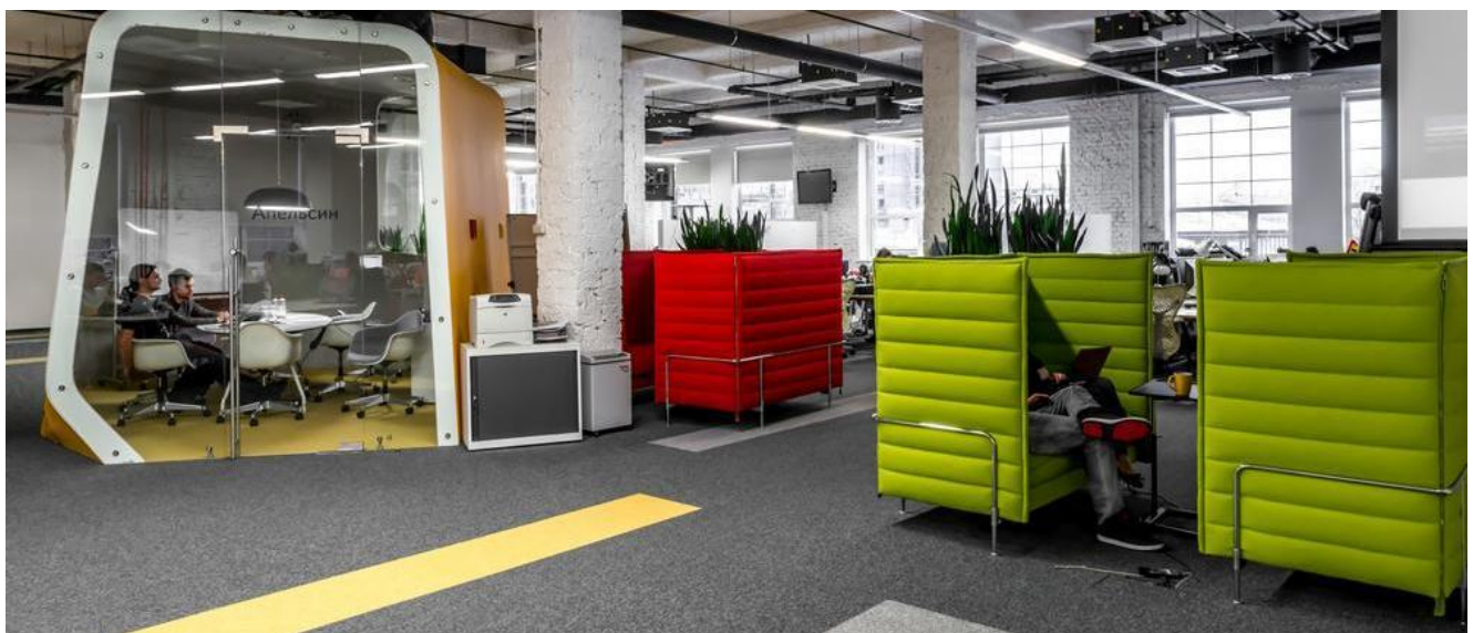
Figure 6: Yandex Stroganov office in Moscow, Russia by Za Bor Architects