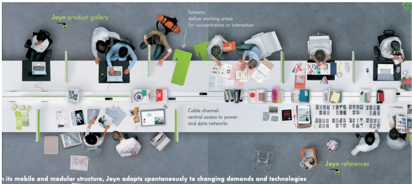
Figure 4: Vitra Joyn, office “Bench” system.

However these solutions were never intended to be standalone and only really work as part of a well-designed scheme where other work modes (Gensler define 4 modes; Collaborate, Focus, Learn, and Socialise) are taken into account and properly catered for.